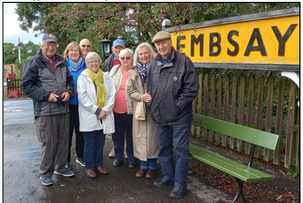
BELOW: These club members put on a brave smile at Embsay station, as they hide their disappointment when they realise that the train is not steam-hauled.