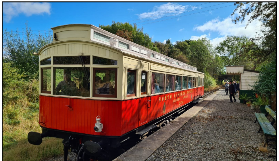
ABOVE: Our sub-editor is not quite sure which station (Bolton Abbey or Embsay) the railway's pride-and-joy diesel electric railcar is picture at. But its wood construction made it doubtful that it will reach the other end of the line, anyway.